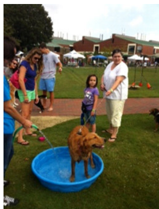
Canine participant cooling off

The Olympic Village featured canine health booths from the NC State University's Veterinary Health Complex and an educational booth with the North Carolina Association of Veterinary Technician board members; vendor tents offering canine-related goods and services; and some 11 rescue groups. 2 Paws Up, Best Friends, Boston Terrier Rescue of NC, Care for Animals, Carolina Care Bullies, English Springer Rescue of America, Neuse River Golden Retriever Rescue, Second Chance, Wake Animal Advocates Group, K9 Kindness and Doberman Rescue of NC.