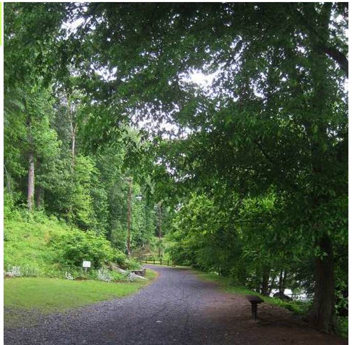
Summer in Raleigh