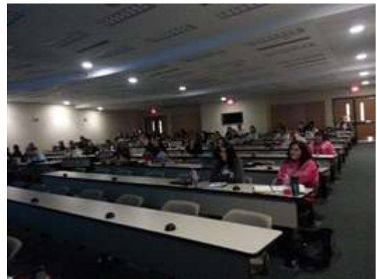
The lecture hall Gaston College